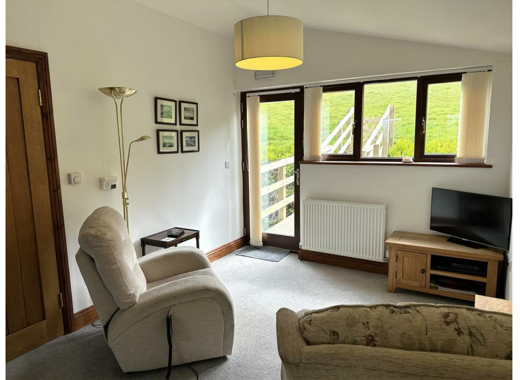
Radiator, door to bridge leading to paddock to the rear, rear window