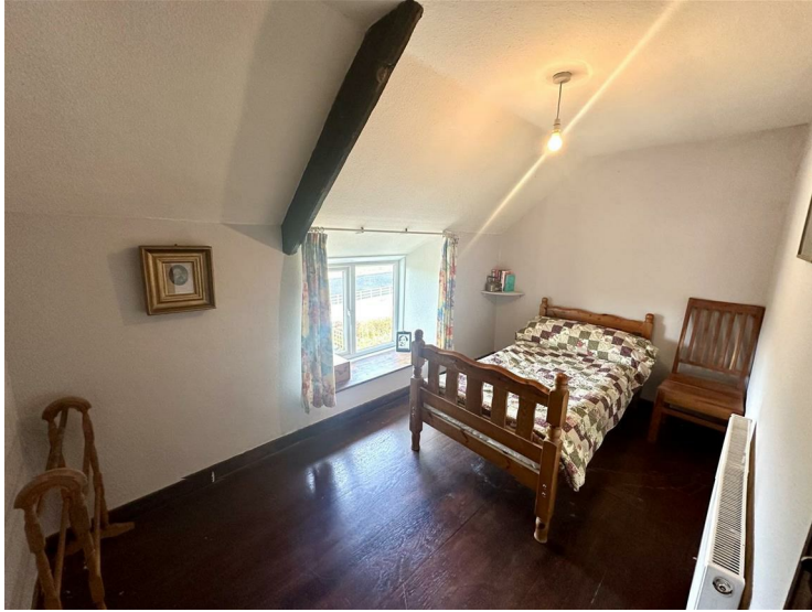
Front window, radiator, stripped pine flooring